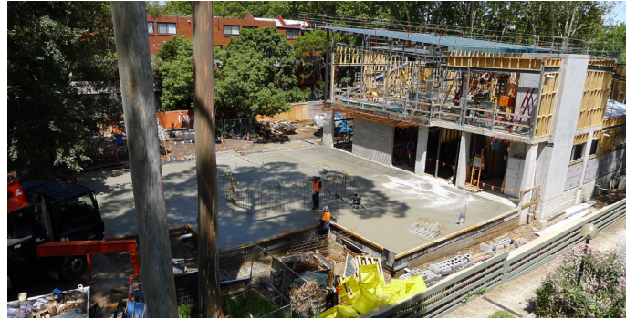
January 2020 – Completion of ground floor slab (front of site)

Saturday internal quiet works only: 3pm to 6pm