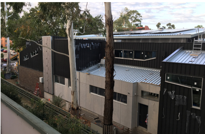
May 2020 - Western façade