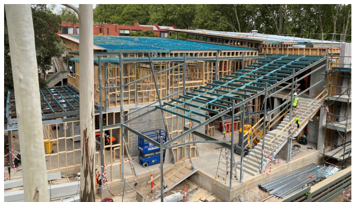
March 2020 – Roof and wall framing (front of site)