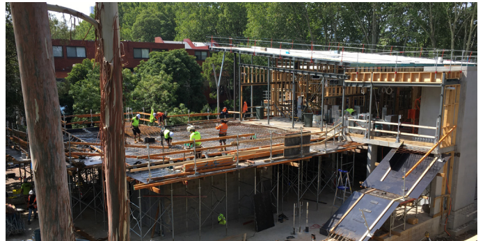
February 2020 – Completion of first slab (front of site)