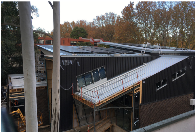
May 2020 - North western façade