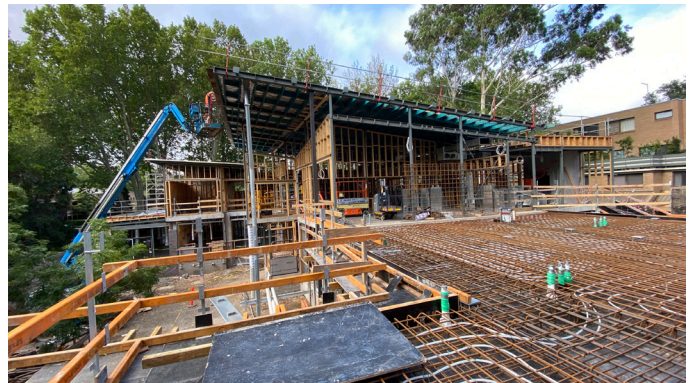
February 2020 – Installation of final section of hydronic pipes