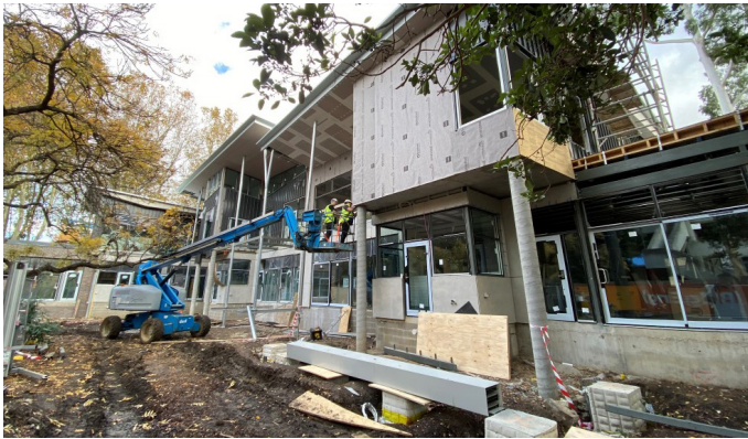
May 2020 - Eastern façade and proposed playground