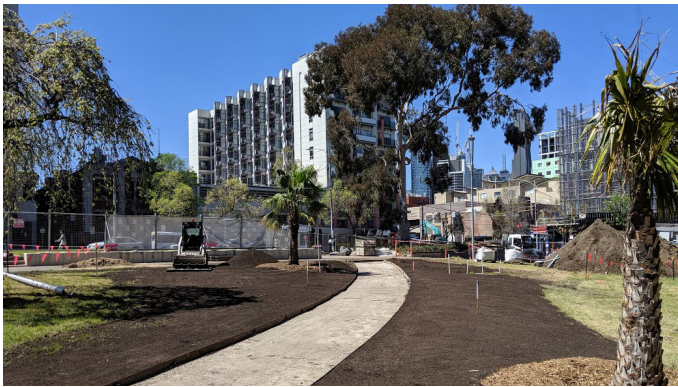
New footpath construction and tree planting at Lincoln Square