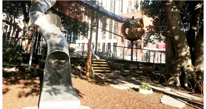
Large steel slide and treetop walk

The project is part of the Lincoln Square Concept Plan. Implementation of the plan commenced in 2019 with the expansion of the park. A significant area of roadway was converted into public open space, with new land and garden beds installed, along with new trees, improved footpaths, bike lanes and lighting.