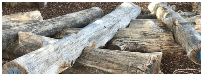
Timber play structure