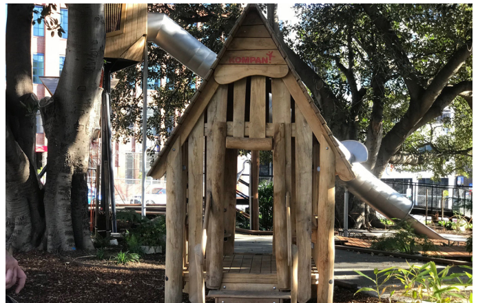
New play equipment