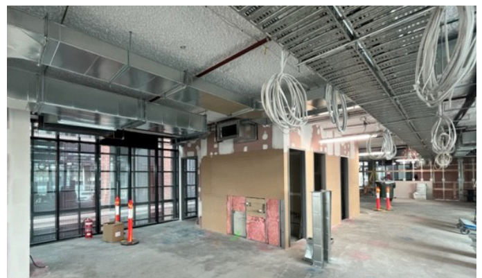
The children's library on level three is taking shape