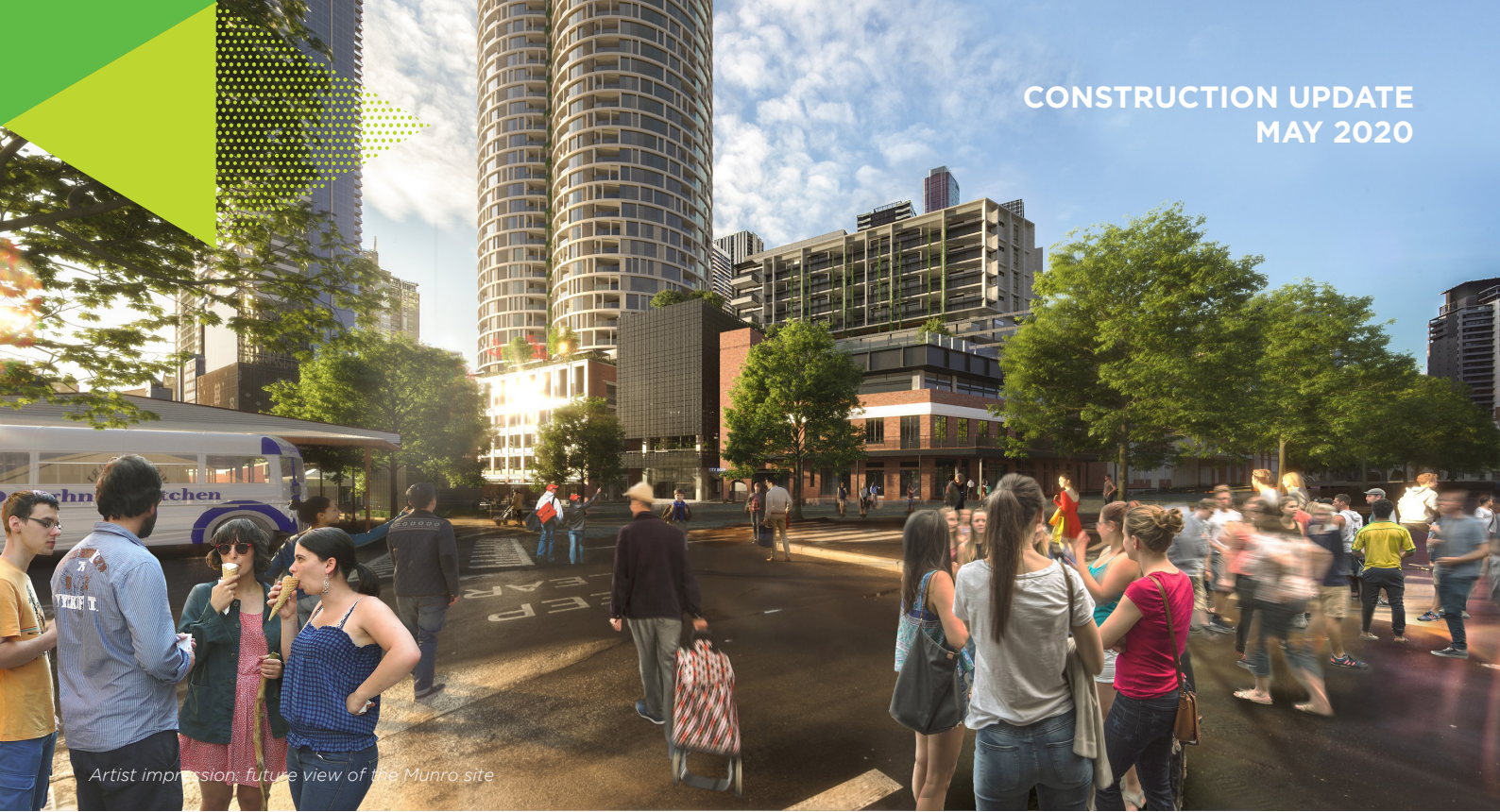
Artist impression: future view of the Munro site