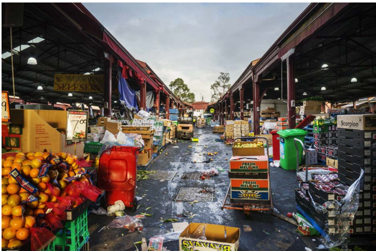
Image 14: A busy access laneway during a trading day.

4.5 Our research revealed that sensory aspects cannot be adequately understood without seeing them as entangled with the other things that people valued : relationships and social connectedness; memory; routines of movement and choice; and contingency and improvisation. Accordingly, changes to the ‘look and feel’ of the Market - are likely to be seen to alter other highly valued ways of understanding it atmospherically.