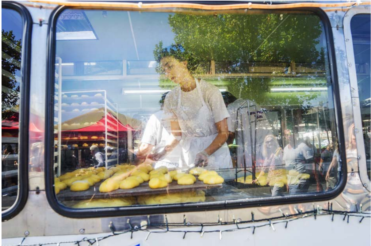
Image 9: The American Donut Van is a central Market landmark.

2.5 The photographs included in and with this report depict a wide array of the various uses of the site at different times of the night and day as people work at different jobs, shop, wander and socialise.