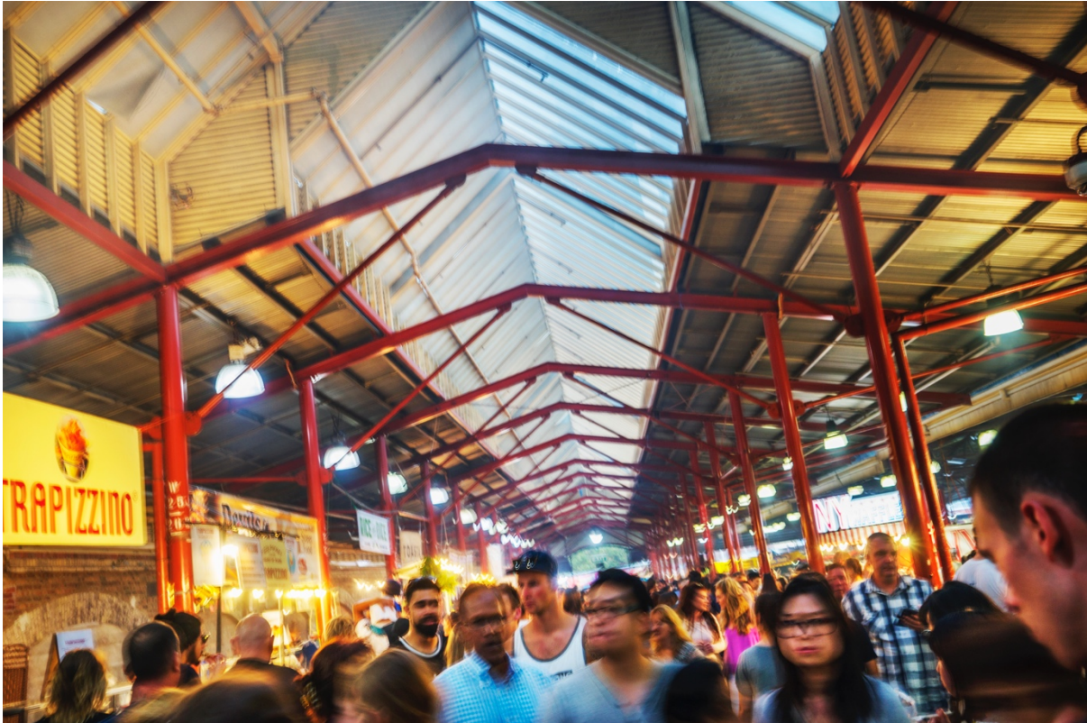
Image 10: The moving crowd at the busy summer Night Market.

At the same time as routines were commonly described as an important part of a visit to the Market, these were actually experienced as quite fluid and contingent. For example, regular shoppers all explained how their habits and routines in the market changed if they saw something they liked or looked particularly fresh, and that their shopping lists transformed as they moved through the site.