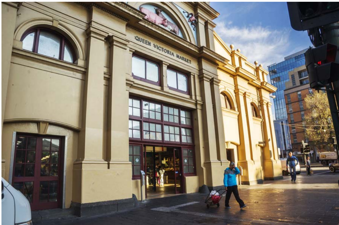
Image 1: An early morning shopper exits the Market.

RECOMMENDATION 4. Design attention should highlight and support the way the Market is used and understood on the move. These might include: wayfinding that is easy to understand whilst moving; circulation spaces that can accommodate trolleys, different speeds of walking and levels of mobility; and places to stop and rest that do not remove people from the flow and excitement of the site.