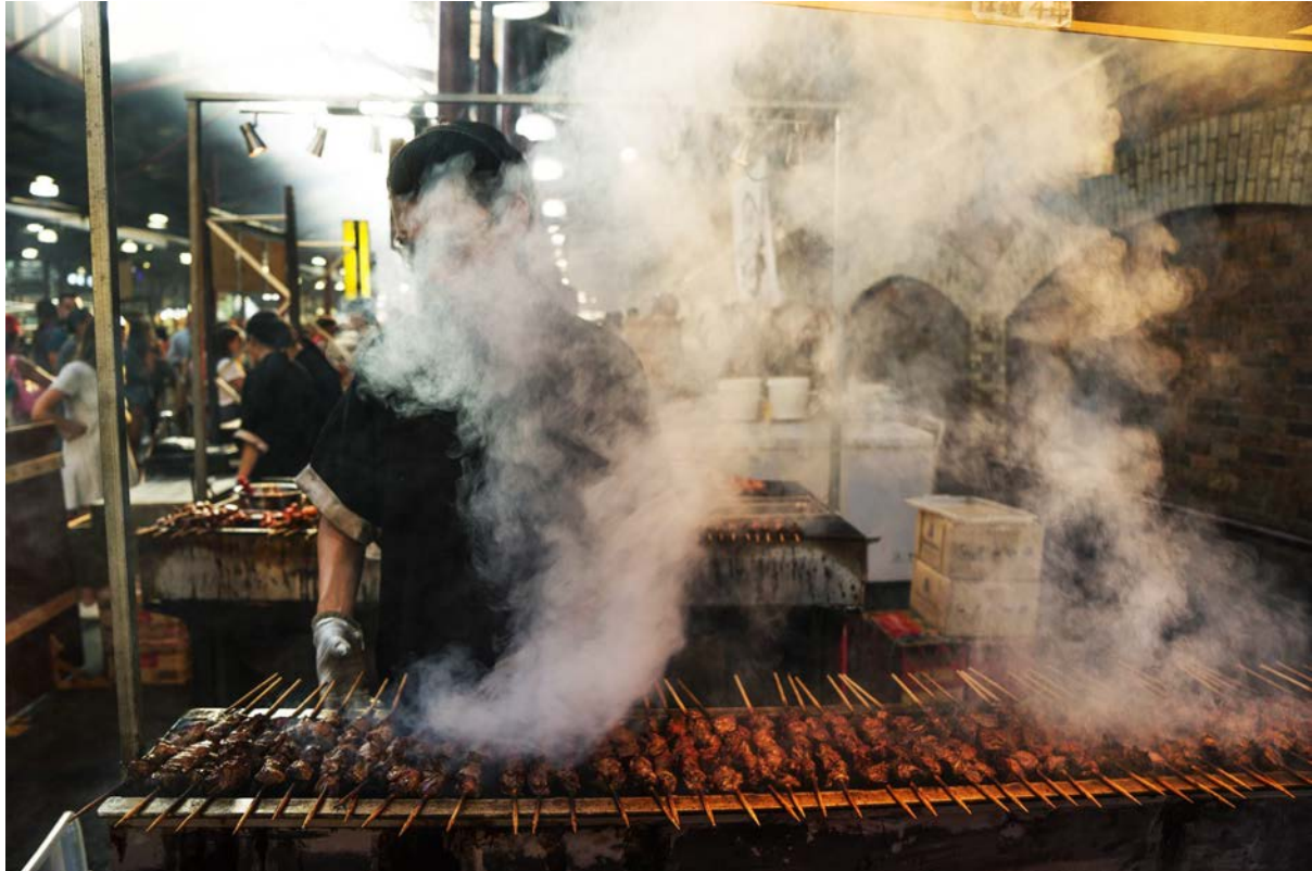
Image 12: Smoke rises from meat cooking at the summer Night Markets.