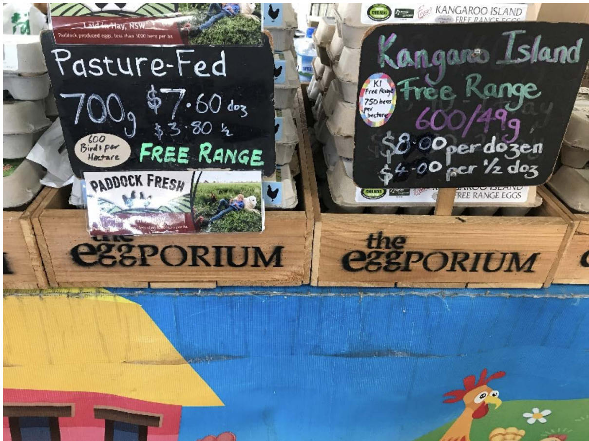
Image 3: A sign clearly indicated how many 'birds per hectare' had produced the pasture-fed eggs.

Absolutely! Absolutely!...We've got Greg's eggs over there which has got 16 hens per hectare. So it's a, It's a moral standpoint...That people really focus on these days. You know? The humane side of things.