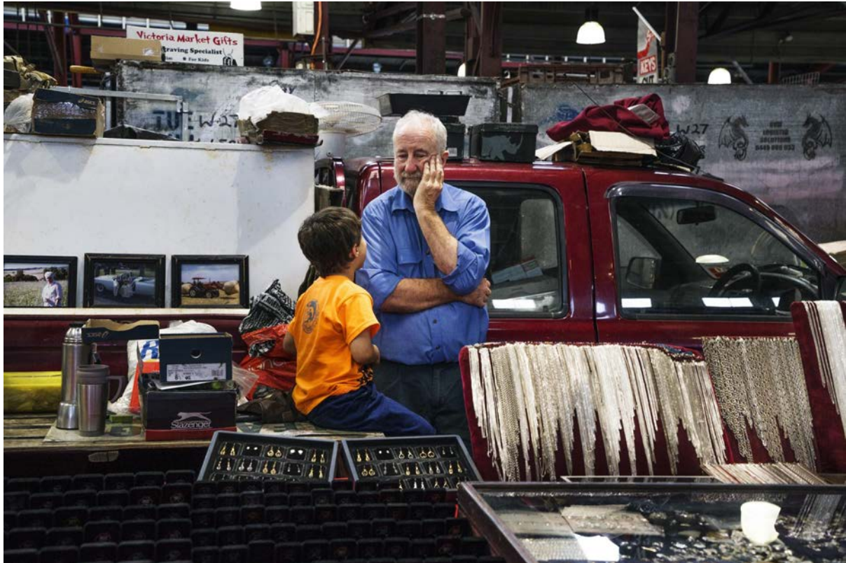
Image 2: The Market is associated with strong connections to family and friends.