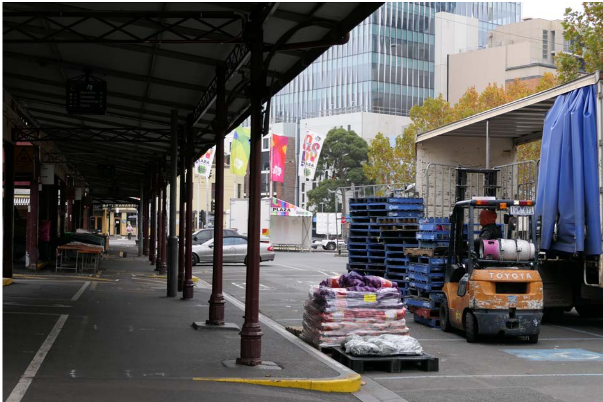
Image 8: Some of the vehicles, objects and goods that are constantly moving around the Market site.

the variable use of car parks in Queen Street at different times of the day and week; the constant collection of fruit boxes or rubbish; and the movement around the site of small vehicles such as trucks, forklifts or large trolleys. This reinforces Key Insight 4 that constant movement is central to the feel of the site, so changes to it will be interpreted as changes to atmosphere.