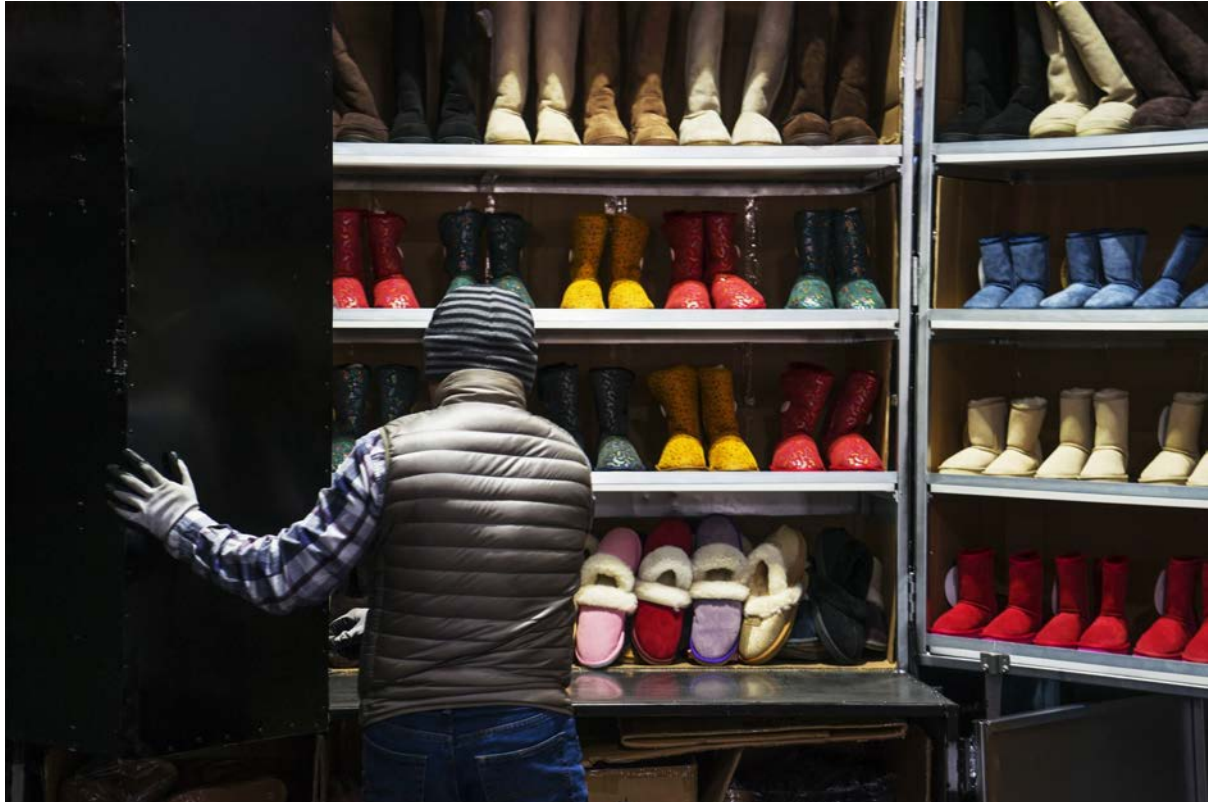
Image 6: Setting up a stall at the beginning of the trading day.

Different routines of moving through the market indicated different ways of using and experiencing it and therefore different meanings ascribed to it. These routines were most obvious for regular users of the site: for regular shoppers, the Market was a site of carefully worked out routines, with favourite traders, times of day and year and even ways of packing shopping trolleys to preserve freshness and protect purchases. For workers, rhythms of cleaning, setting up and packing down, loading and unloading were constant and ongoing.